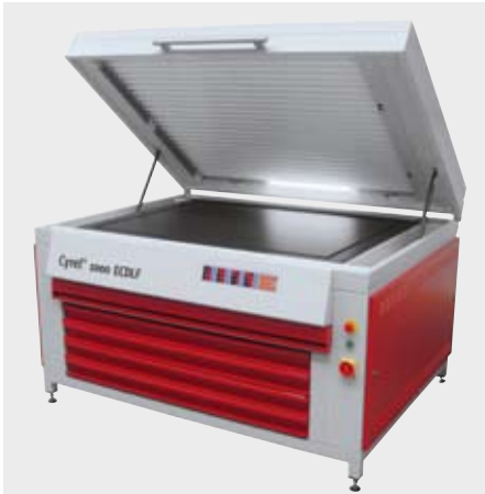
DuPont™ Cyrel® 1000 ECDLF