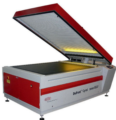
DuPont™ Cyrel® 2000 ECLF

DuPont Packaging Graphics continues to be a global technology leader in the development and supply of flexographic printing systems. Our R&D team continues to develop innovative new solutions to help our customers expand their business by taking advantage of new and profitable opportunities in the growing flexographic packaging market. The DuPont Packaging Graphics portfolio of products includes DuPont™ Cyrel® brand photopolymer plates (analogue and digital), Cyrel® platemaking equipment, Cyrel® round sleeves, Cyrel® plate mounting systems and the revolutionary Cyrel® FAST thermal system.