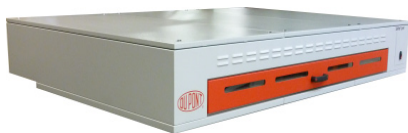
DuPont™ Cyrel® 3000 LF

DuPont Packaging Graphics continues to be a global technology leader in the development and supply of flexographic printing systems. Our R&D team continues to develop innovative new solutions to help our customers expand their business by taking advantage of new and profitable opportunities in the growing flexographic packaging market. The DuPont Packaging Graphics portfolio of products includes DuPont™ Cyrel® brand photopolymer plates (analogue and digital), Cyrel® platemaking equipment, Cyrel® round sleeves, Cyrel® plate mounting systems and the revolutionary Cyrel® FAST thermal system.