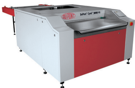
DuPont™ Cyrel® 3000 PS

DuPont Packaging Graphics continues to be a global technology leader in the development and supply of flexographic printing systems. Our R&D team continues to develop innovative new solutions to help our customers expand their business by taking advantage of new and profitable opportunities in the growing flexographic packaging market. The DuPont Packaging Graphics portfolio of products includes DuPont™ Cyrel® brand photopolymer plates (analogue and digital), Cyrel® platemaking equipment, Cyrel® round sleeves, Cyrel® plate mounting systems and the revolutionary Cyrel® FAST thermal system.