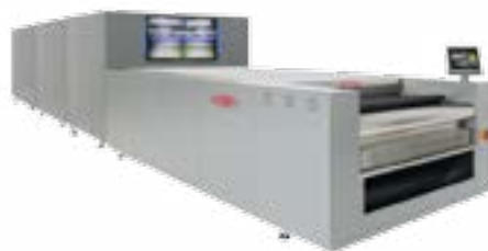
DuPont™ Cyrel® Modular InLiner System

The DuPont™ Cyrel® 3000 Modular InLiner provides a 25% increase in platemaking productivity.