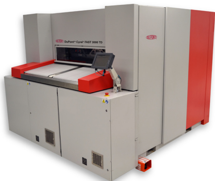
DuPont™ Cyrel® FAST 3000 TD