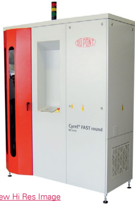
View Hi Res Image