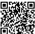
Download latest version

DuPont Packaging Graphics continues to be a global technology leader in the development and supply of flexographic printing systems. Our R&D team continues to develop innovative new solutions to help our customers expand their business by taking advantage of new and profitable opportunities in the growing flexographic packaging market. The DuPont Packaging Graphics portfolio of products includes DuPont™ Cyrel® brand photopolymer plates ( analogue and digital ), Cyrel® platemaking equipment, Cyrel® round sleeves , Cyrel® plate mounting systems and the revolutionary Cyrel® FAST thermal system .