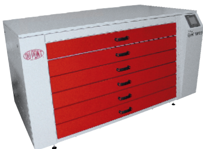
DuPont™ Cyrel® 1000 D

DuPont Packaging Graphics continues to be a global technology leader in the development and supply of flexographic printing systems. Our R&D team continues to develop innovative new solutions to help our customers expand their business by taking advantage of new and profitable opportunities in the growing flexographic packaging market. The DuPont Packaging Graphics portfolio of products includes DuPont™ Cyrel® brand photopolymer plates (analogue and digital), Cyrel® platemaking equipment, Cyrel® round sleeves, Cyrel® plate mounting systems and the revolutionary Cyrel® FAST thermal system.